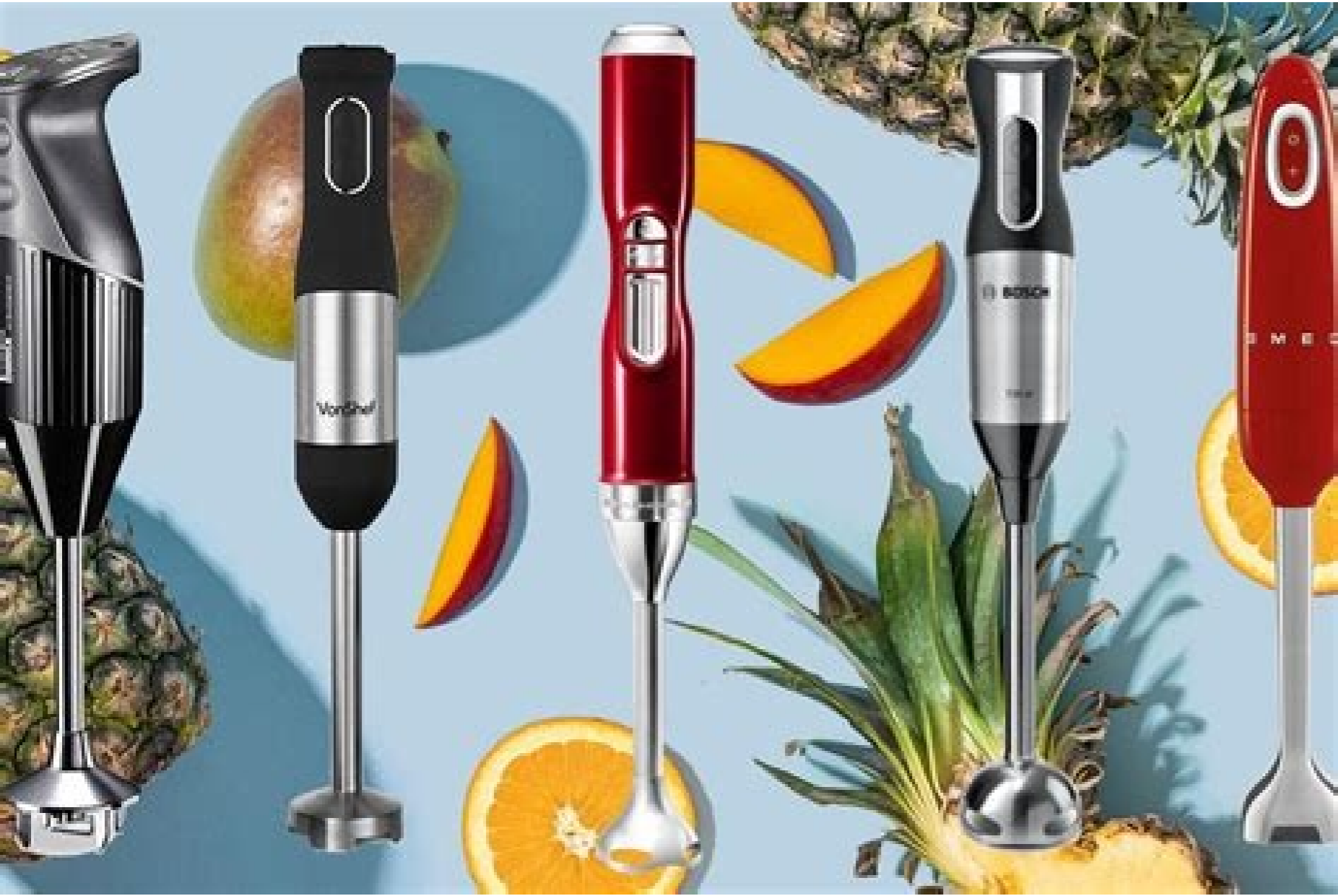
Hand blender online pakistan.